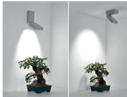
endless fixture head positions