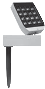
AC037 EARTH SPIKE