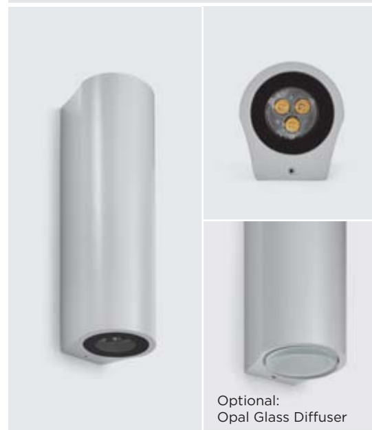
Optional: Opal Glass Diffuser