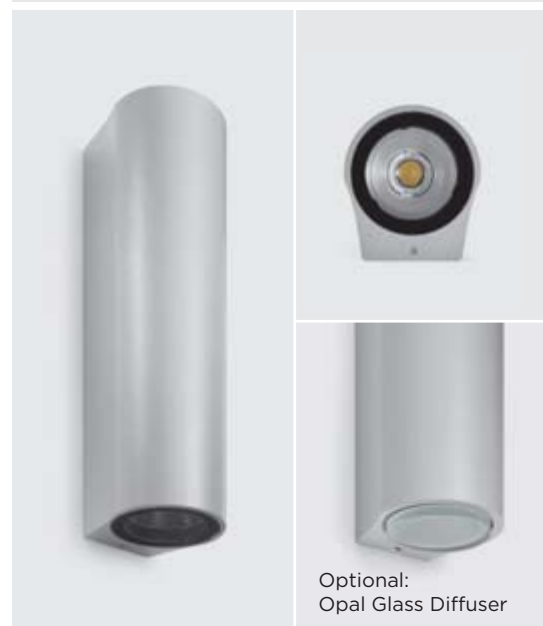
Optional: Opal Glass Diffuser