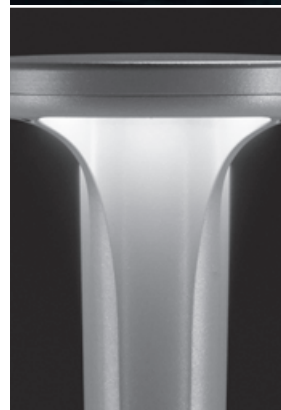
AC065 ANCHORAGE UNIT FOR ALDER SERIES