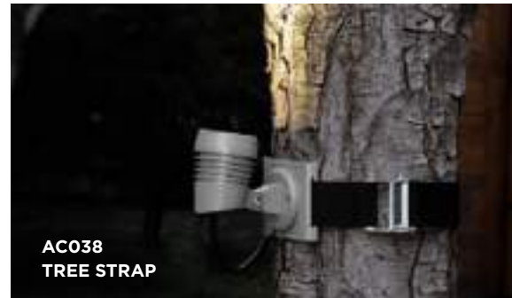
AC038 TREE STRAP